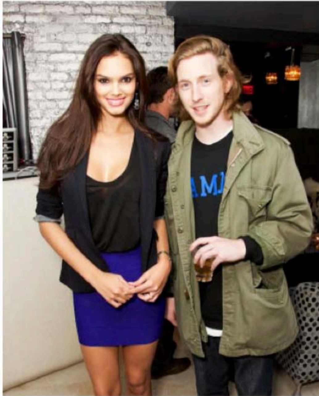
Supermodel Lisalla Montenegro and rapper Asher Roth drinking GIVEN at Polar Lounge In The Marcel